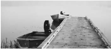
An early morning mood shot