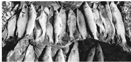
Some of the keepers, soon to be converted into dinner