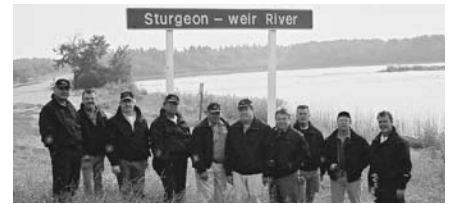
The Pro-Tech boys on their arrival at the river